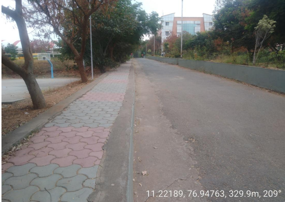
Pedestrian Friendly pathways

Affiliated to Anna University & Approved by AICTE, Accredited by NAAC